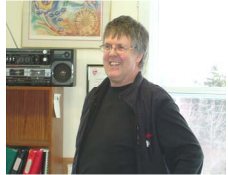
Peter Brand First People's Cultural Foundation